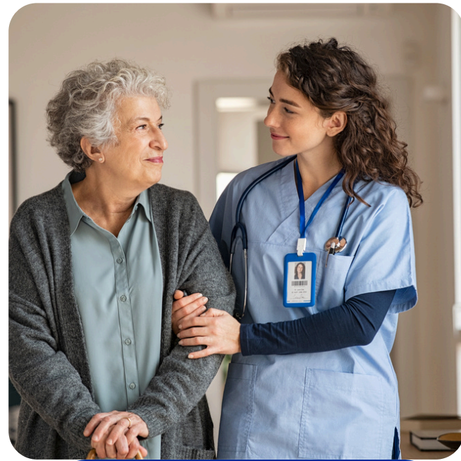
CNA Prep In-Person