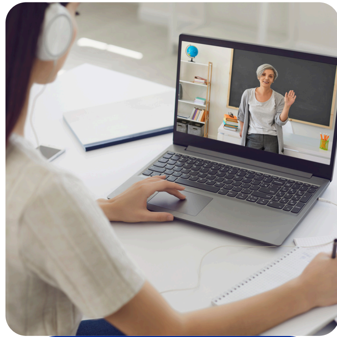
CNA Prep Online