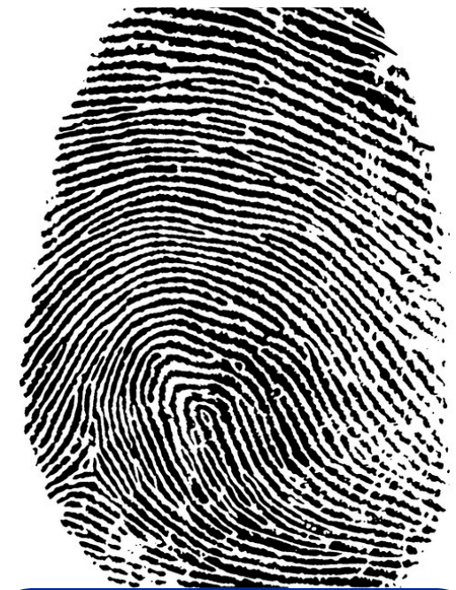
Level II Background Check